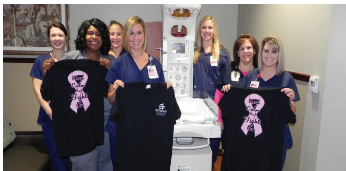
Birth Suites staff displays shirts sold to support breast cancer patients

A special thanks to the event sponsors: Brasfield & Gorrie, Adams and Reese LLP, Altec Inc., Basic Drywall, Inc., Bruno Event Team, BTC Wholesale Distributors, The Frank & Lillian Buckner Foundation, CARVANA, Hardy Corporation, Hoar Construction, Maynard Cooper Gale, Merrill Lynch Wealth Management, and ServisFirst Bank.