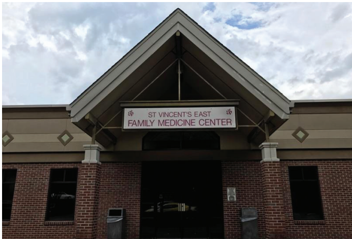
St. Vincent's East Family Medicine Center