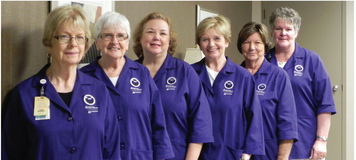
St. Vincent's Health System Volunteer Council

It's a typical day in a St. Vincent's Health System hospital lobby. Visitors are greeted warmly. Outpatients are escorted to labs. Families select their gift shop purchases.