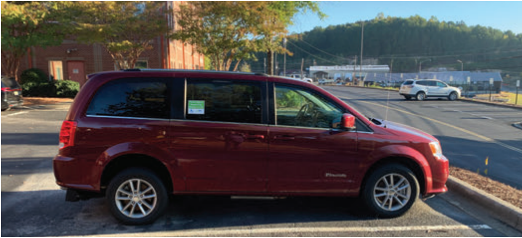
Van provided by Foundation donors serves vulnerable patients in Blount County.