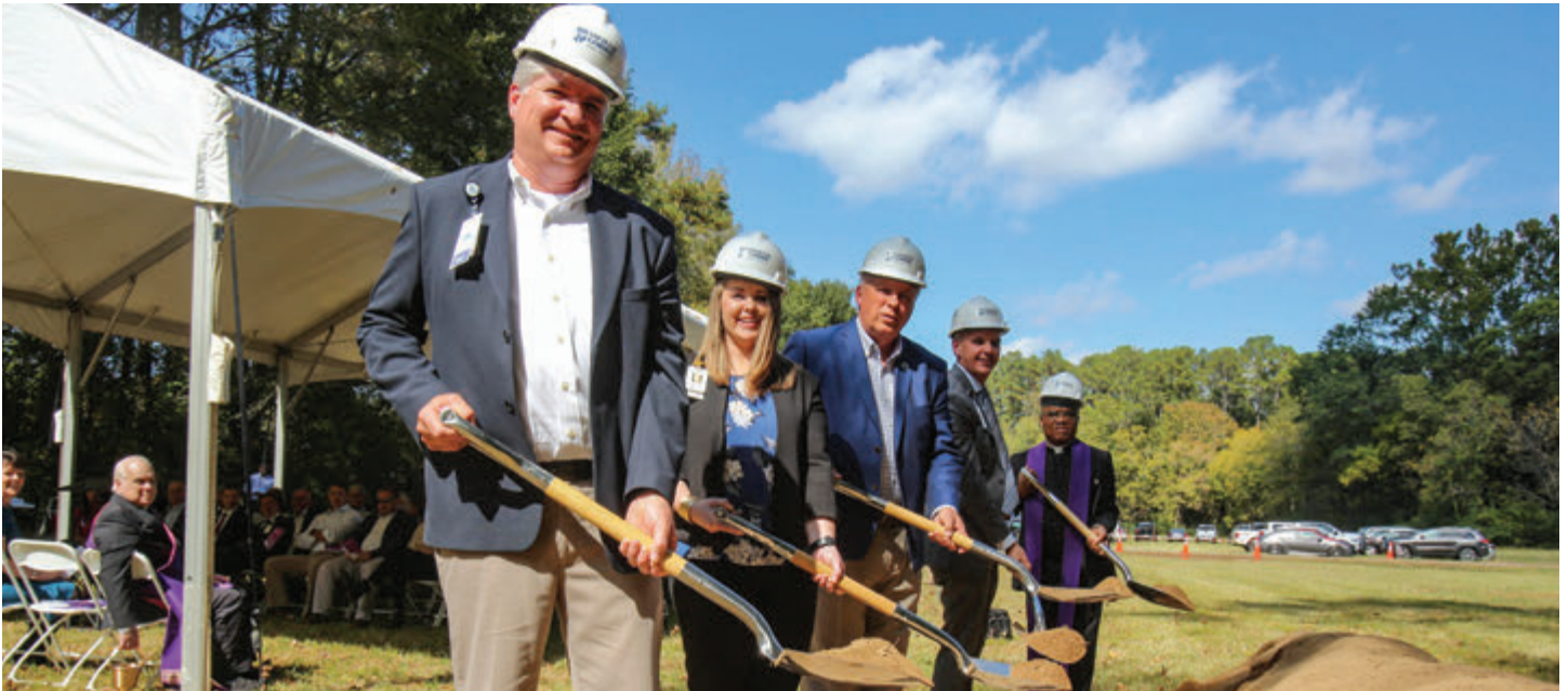
A groundbreaking ceremony was held October 13.

“Since the beginning of the pandemic we have seen more patients in our emergency departments, and they are sicker than before.”