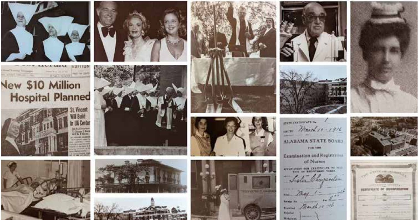
Ascension St. Vincent's is celebrating its 125th anniversary